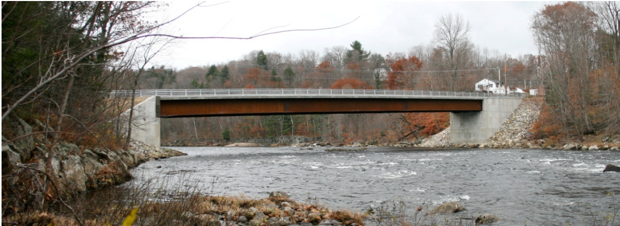
Central Street Bridge (before and after reconstruction)